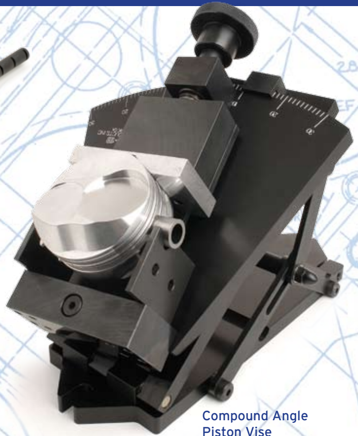
Compound Angle Piston Vise Page 24