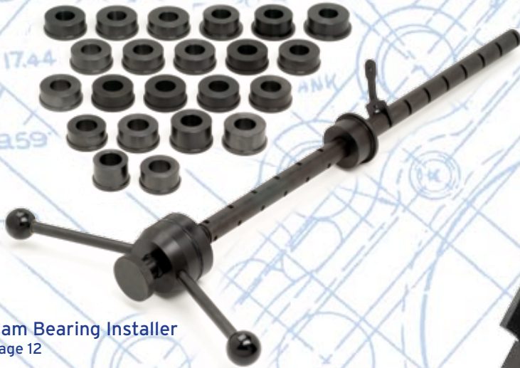
Cam Bearing Installer Page 12