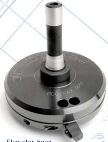
Flycutter Head Page 15