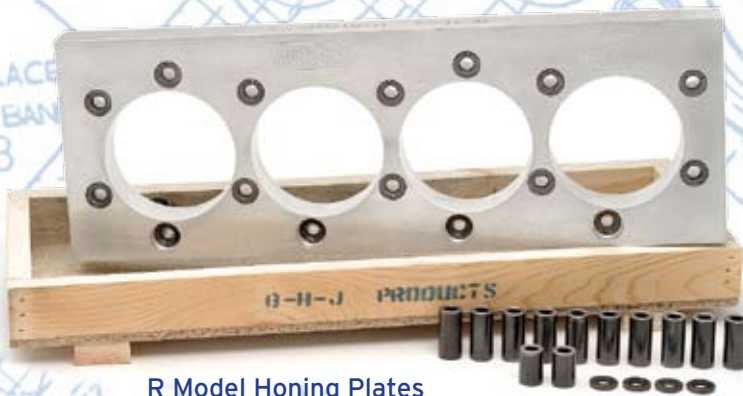
R Model Honing Plates Page 16